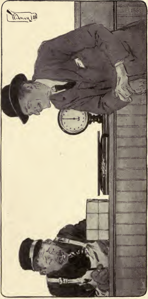
“‘Pho-e-nix!’ Is it a man’s name, I dunno?”